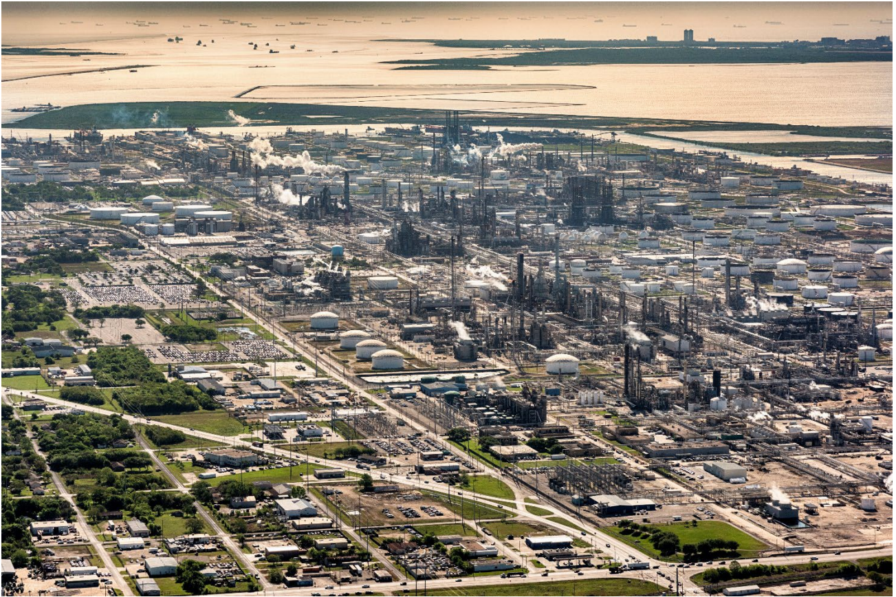
Texas Oil Refinery.

“Galveston’s” oil-and-gas rush consumed the region. It consumed freshwater supplies, causing the land to subside, and, in turn, consumed an oil field and a neighborhood. It consumed land and water with its toxic dumping as well as the climate-stabilizing components of the atmosphere and oceans. Maybe, one day in the not-too-distant future, it will also consume the “pioneering spirit”—what for many peoples has been a colonizing spirit and, for future generations, a depleting spirit.