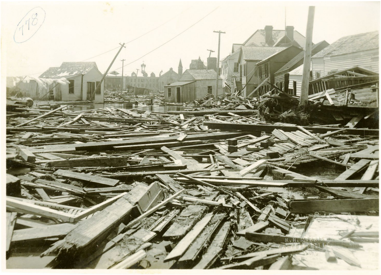
Debris near houses after the Great Storm of 1900.

The lesson of the Great Storm for First Peoples was likely a confirmation of what they had known and passed down for generations—that the island and bay are bounteous places, but they can be deadly as well. Visit, even camp there for short periods, but do not stay, especially in late summer and early fall. The lesson for Second Peoples was different: rebuild for some, migrate further inland for others. The upper bay may not be ideal, but at least it is better protected—with precautions, a permanent year-round settlement is possible. Little could they have known, in the nineteenth century, that this frontier mode could be continued for another century and more with underground extraction. And little could they have known that, like so many migrations, each phase is only temporary, each place, from Galveston Island to the uplands, only a way station until people learn to live in their place, until the economy matures past mere extraction.