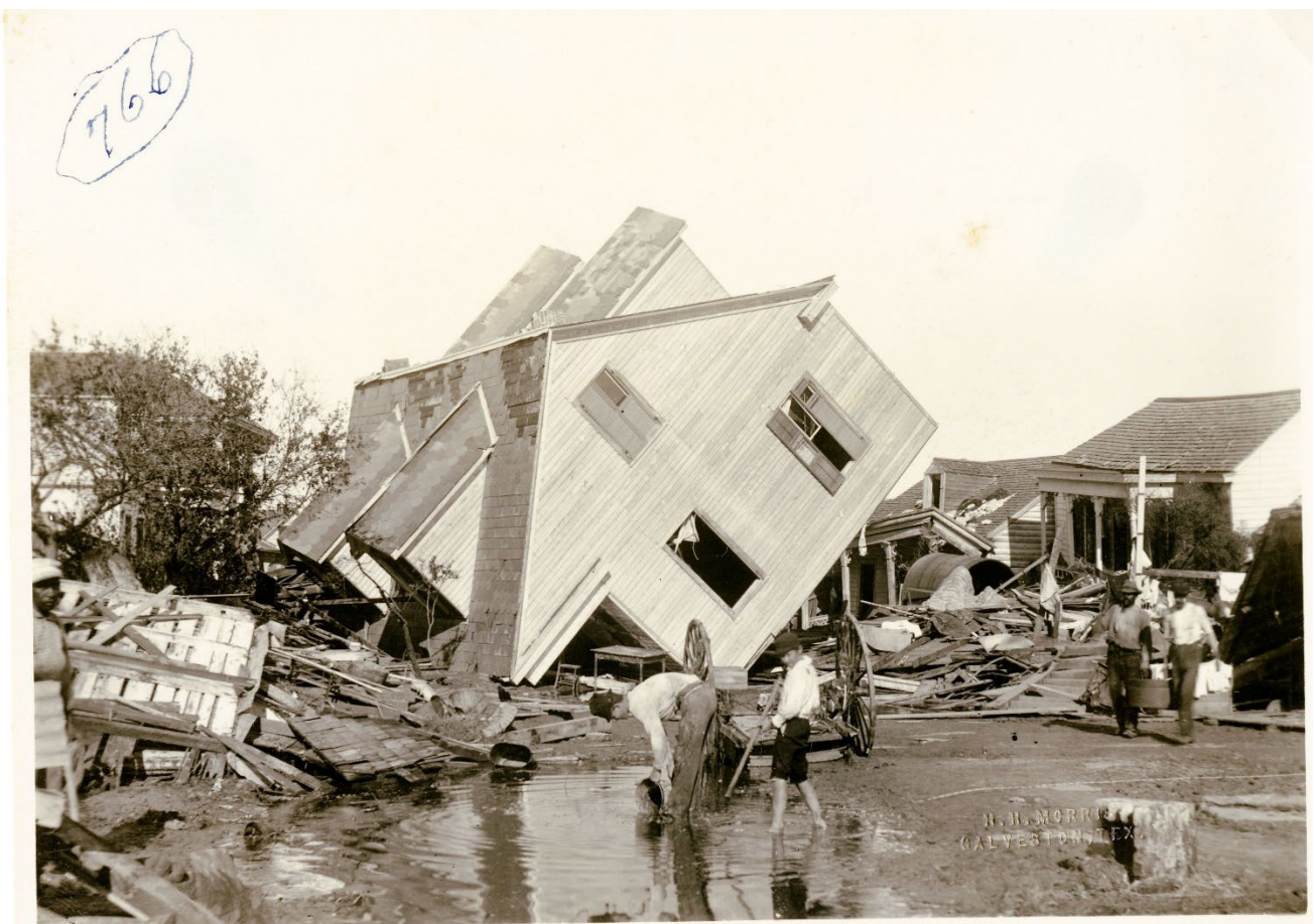
Men working near an overturned house after the Great Storm. This image has been cropped.

Texas had seen rain before, plenty. It had flooded before, many times. But on 25 August 2017, Hurricane Harvey dumped a volume of water never before contemplated. The storm had become wedged between two weather systems, one trying to push north, the other south. At landfall, it was 450 kilometers in diameter, with 209 kilometer-per-hour winds. Its circulation, extending well out over the Gulf of Mexico, brought a continual flow of moisture. When Harvey stalled out over the Houston-Galveston area for four days, it dropped 60 centimeters of rain in the first 24 hours in certain areas. Due to the region's vast expanses of impermeable roads, parking lots, sidewalks, and rooftops, all built on a flat coastal plain, there was no place for the water to go for days. At the storm's peak, one-third of Houston was underwater, and at least 68 people in Texas died from the direct effects of the storm.