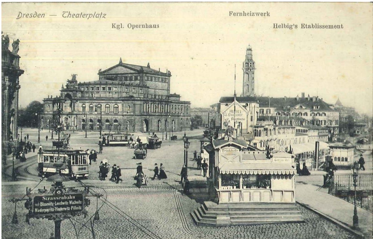
Postcard showing Dresden's Theaterplatz (Theatre Square) with the Royal District Heating and Electricity Plant on the right, 1908. All rights reserved.

chimneys . . . are so terribly insulting to this foreigners' paradise, pensioners' idyll, and dignified royal seat," 3 were sure to have been pleased.