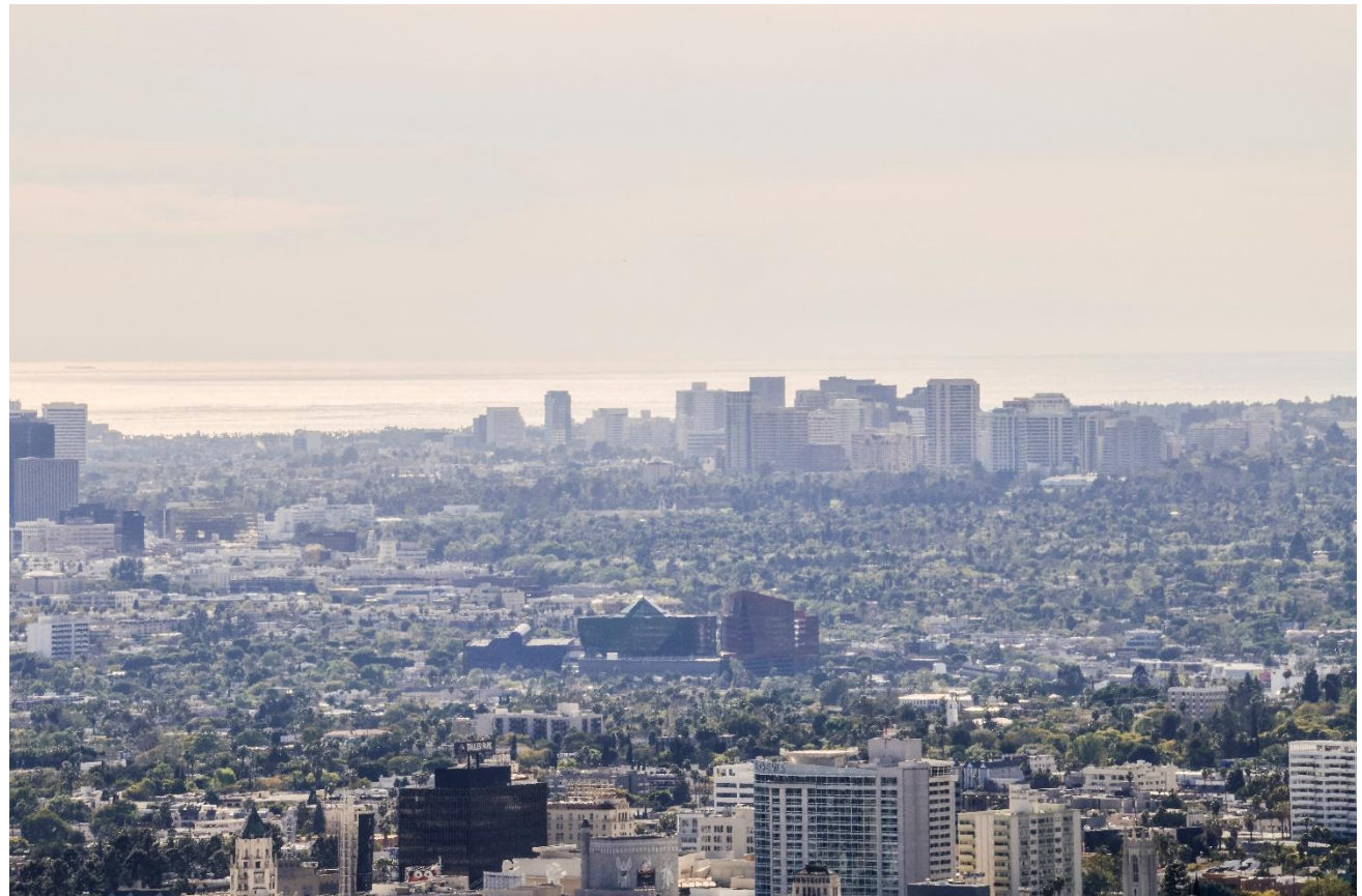
Cityscape of Los Angeles.

These important contrasts, however, make comparing the two cities' history more, not less, interesting: Why did two cities, radically different in their cultural origins, come to resemble each other in size, cityscape, and perhaps even in temperament? Why has each grown from inconspicuous beginnings to a giant metropolis over the past century, and why have they attracted millions of inhabitants?