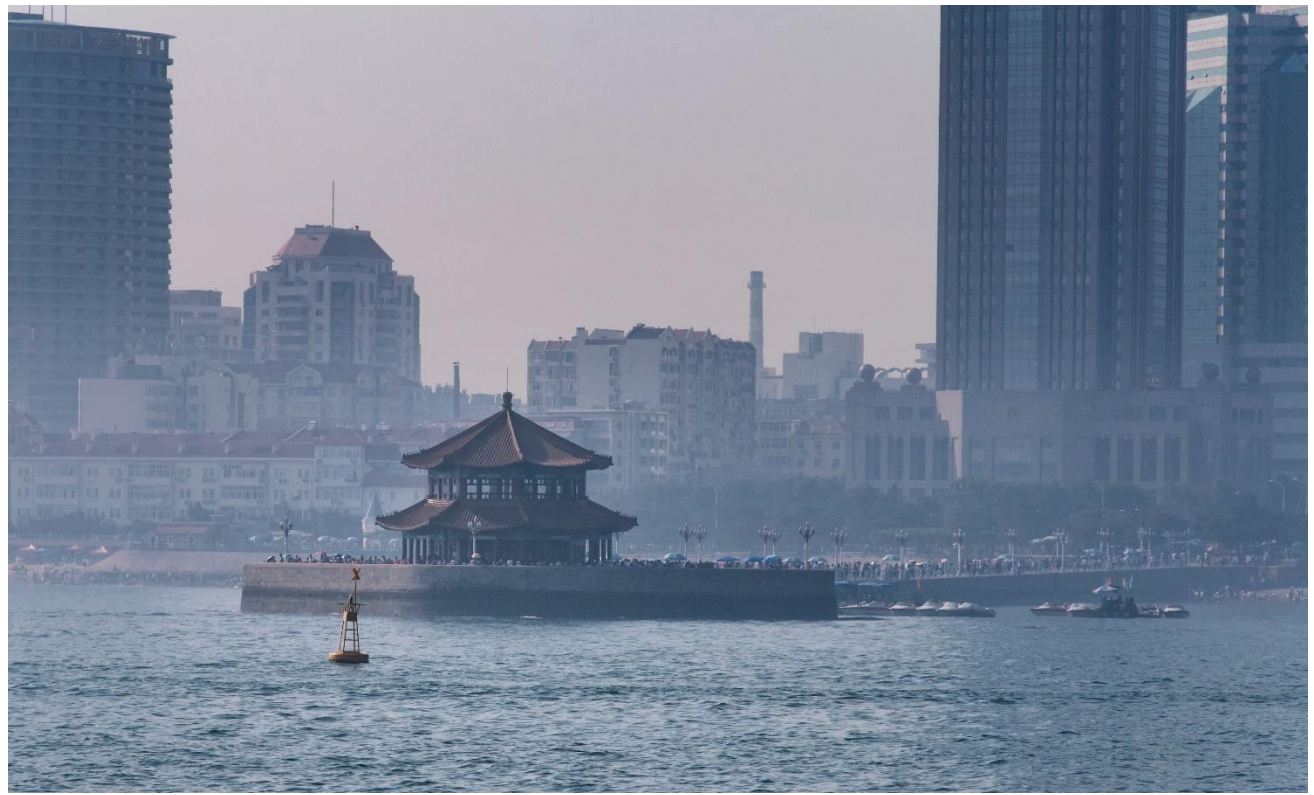
Zhangiao Pier, Qingdao.

The next year, German colonists started constructing a port on this strange site, envisioning a city with a comprehensively planned environment. As an industrial power, the newcomers anticipated building infrastructure such as shipyards, textile factories, and even a brewery in the colony, as well as a railroad to connect their new city with the resources of northern China. Yet, they wanted more.