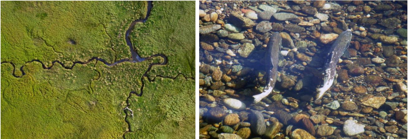
(Left) Polluted creeks in a coastal marsh in Oregon, United States. (Right) Chinook salmon in their riverine environment.

the water still rests with a private power company (guaranteed under pre-existing laws until 2039). While the Whanganui River was accorded rights of legal personhood, the interests of corporate energy producers were, more often than not, incorporated via the common law.