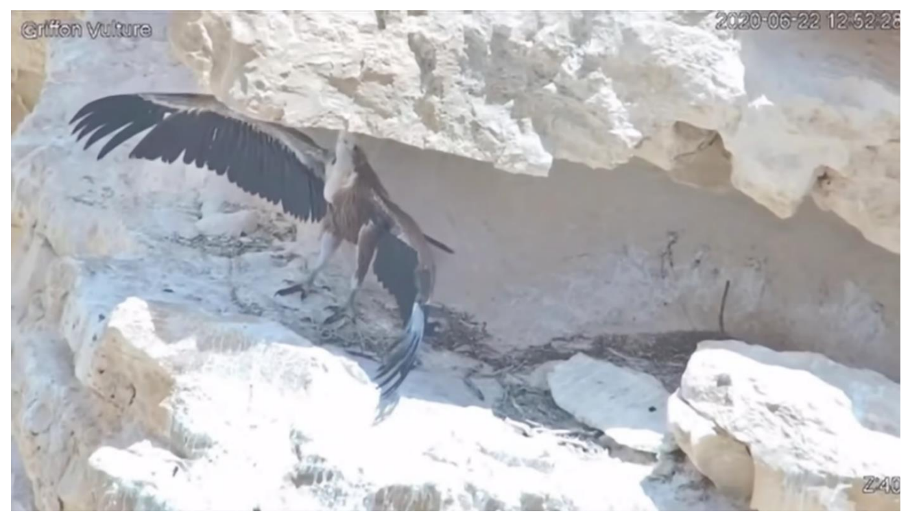
Fig. 2. After his mother died by electrocution, an endangered vulture chick is fed by "Mother drone," an advanced technology operated by the Israeli army.

This three-minute news item encapsulates the three-way dance between conservation, digital technology, and the Israeli army. The blurred classified drone, the obscured military general, and the three men—from high tech, conservation, and the military—congratulating themselves on their mothering skills, all occurred at one of the most visited national parks in Palestine-Israel, Ein Avdat in the southern Naqab-Negev desert, and was broadcasted live to the Israeli public via a 24/7 camera installation. This was not the first, nor would it be the last, collaboration between Israeli conservationists and the army.