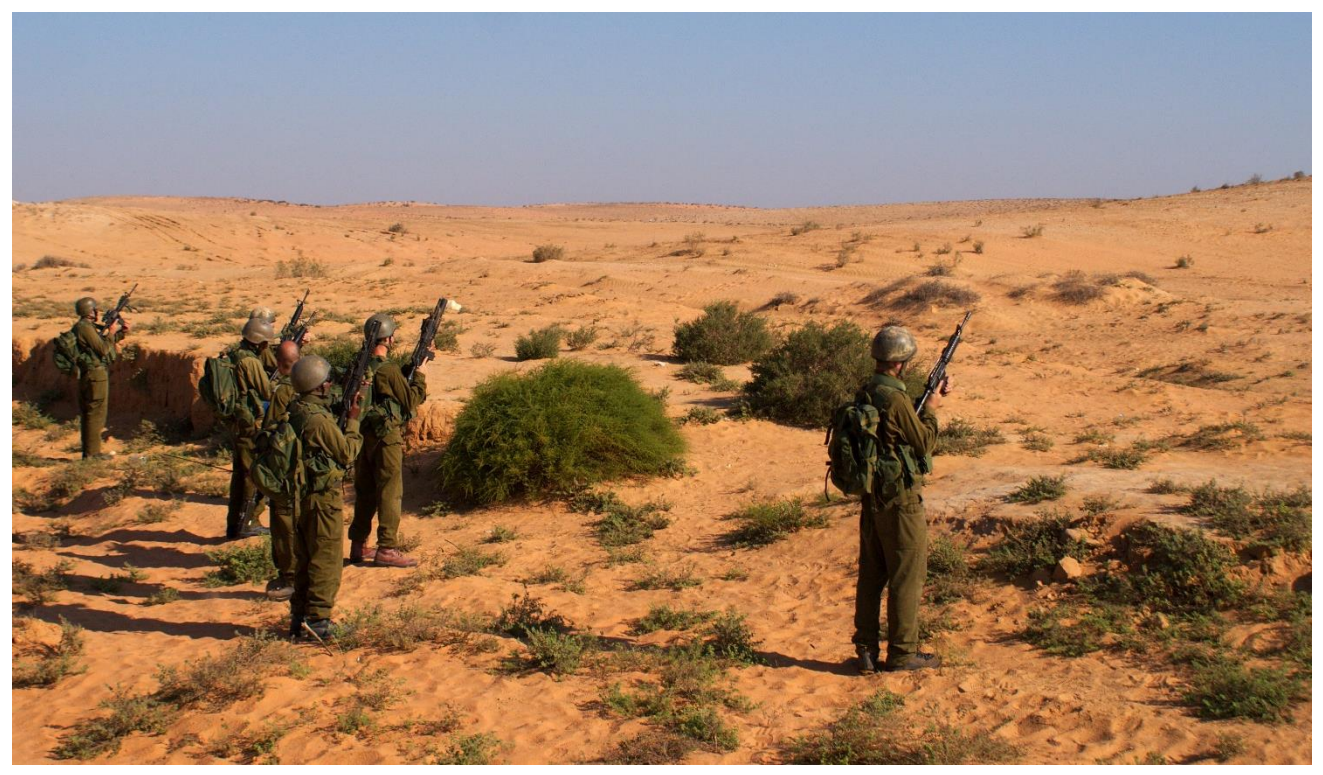
Fig. 1. Israeli soldiers exercise in a desert.

In July 2020, Israeli television reported on an endangered griffon vulture ( Gyps fulvus ) chick who had lost his mother to electricity wires. As would soon become clear, the chick's father was unable to provide enough food to ensure his son's survival. The Israeli army, referred to by most Israelis as the Israel Defense Forces (IDF for short, or Tsahal in Hebrew), readily stepped in, using a state-of-the-art drone technology to drop daily offerings of rat food for the chick by deftly managing the intense cliffs. "Mother drone," as the army referred to this technology, was blurred in the video that documented the operation. It had to be, the reporter explained, because it "belongs to the Israeli army and is classified as top secret." Standing with his back to the camera, the military general in command told the reporter about the countless hours spent practicing the delivery on a mock-up of the ledge and nest before the military started food drops for real. The report ended with the following statement: "The collaboration between a tech company, the military, and conservationists got the ultimate endorsement this week when the chick flew for the first time. Job [well] done!" (Figure 2).<sup>1</sup>