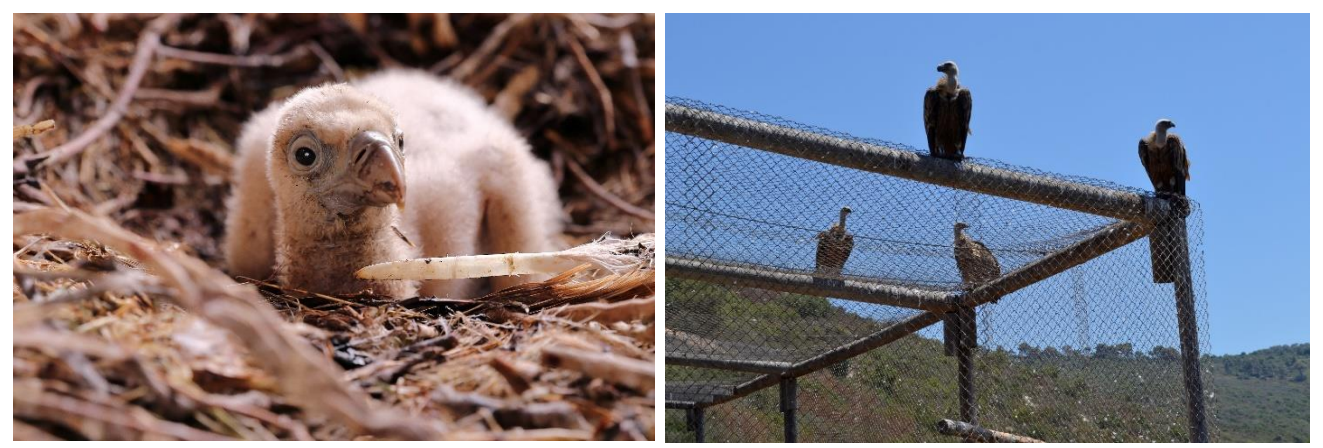
Fig. 3. (Left) A griffon vulture chick. (Right) Griffon vultures on top of their special training cage in the Carmel Mountains, Palestine-Israel.

There are currently 220 vultures in Palestine-Israel. They are intensively managed using various forms of digital conservation. The chief ornithologist for Israel's Nature and Parks Authority told me accordingly: "I cannot think of any other animal on this planet with such high monitoring rates. We have about 80 percent monitored by GPS and 75 percent of the vultures are tagged, meaning we know their history and we also [genetically] sample each one."<sup>13</sup> Through this digital monitoring, an enormous body of data is accumulated about the vulture's location, body temperature, and movement. Specifically, acceleration data that identifies movement is analyzed to extract nuanced information about vulture behavior. This type of study is situated within the field of movement ecology, which promotes an understanding of movement patterns and their role in various ecological and evolutionary processes. Such complex conservation projects necessitate engagement with computer science, paradoxically distancing biologists from the very sites and materialities of their research. The alienation that occurs with such conservation management by algorithm highlights that "digital data enables and encourages the automation of conservation decisions."<sup>14</sup>